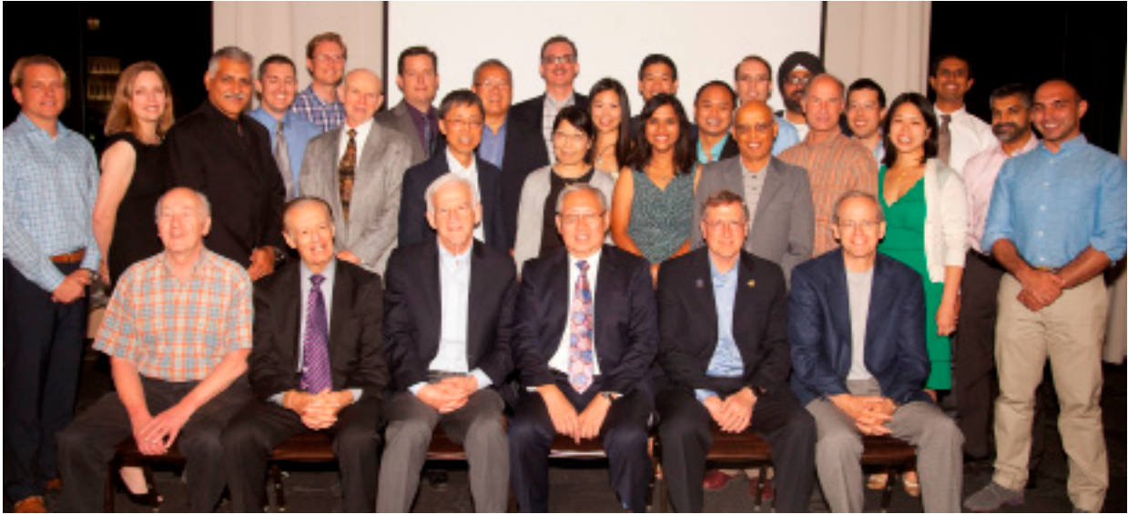
June 2014 UC Davis Fellows